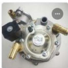
DRACO T1 LPG REGULATOR

Cadaadiska ugu badan ee gelitaanka: 45 bar Cadaadis nidaaminta heerka koowaad: 0.6 bar awoodda gariiradda: 14 watts