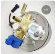
PEGASUS LPG REGULATOR