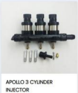
APOLLO 3 CYLINDER INJECTOR