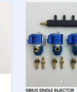
SIRIUS SINGLE INJECTOR