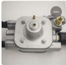
LIGER X LPG REGULATOR