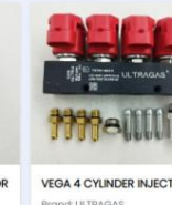
VEGA 4 CYLINDER INJECTOR Brand: ULTRAGAS