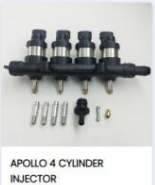
APOLLO 4 CYLINDER INJECTOR