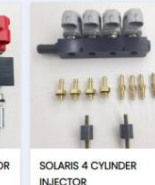
SOLARIS 4 CYLINDER INJECTOR