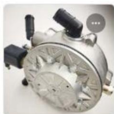
ORION L2 LPG REGULATOR