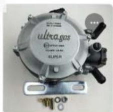
ORION-L1-SUPER-PL LPG REGULATOR