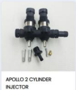
APOLLO 2 CYLINDER INJECTOR

kor u qaadida shakhsiga iyo isku imaatinka la taaban karo iyo degdega ah ee nozzles durdurada waxay bixiyaan faa'idooyin la taaban karo inta lagu jiro beddelka. Habka nadiifinta ayaa hubinaysa ilaalinta muddada dheer ee maalgashigaaga. Waxay la socotaa dammaanad 100,000 km ah.