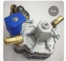
Monza X LPG REGULATOR