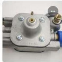
TIGER X LPG REGULATOR