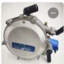
ORION L1 LPG REGULATOR