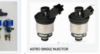
ASTRO SINGLE INJECTOR