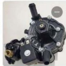
FOCUS X BLACK LPG REGULATOR