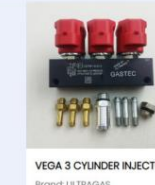
VEGA 3 CYLINDER INJECTOR Brand: ULTRAGAS