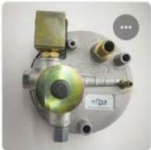
ARDA X LPG REGULATOR